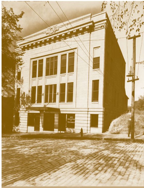
Second Atlanta Labor Temple building, erected 1916-1917 at 112 Trinity Avenue. [L1972-04_03]

You can now keep up with activities in the Southern Labor Archives by subscribing to GSU Library's blog ( http://homer.gsu.edu/blogs/library/ ) or by "liking" us on the Special Collections and Archives, Georgia State University Library Facebook page ( http://tinyurl.com/3gsbm5w ).